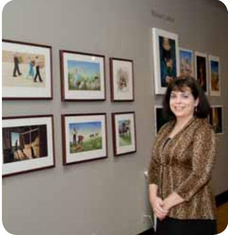
Student at her Thesis Exhibit