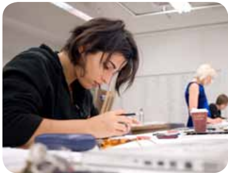
Student working on her assignment in class