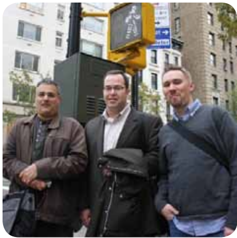
Students in New York City during Contact Period

This MFA in Illustration program has brought some of the best illustrators from around the country together to push and challenge their students to be the best they can be. The program offers the best in overall quality and flexibility for working illustrators. I could have never obtained my MFA if it wasn't for this program... and what a program!